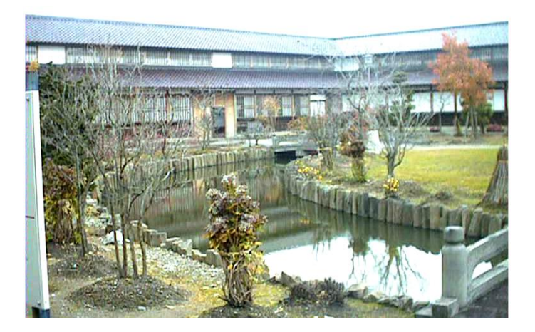
In the Nisshinkan compound

In bonsai, the miniature trees are trimmed and pruned to provide enough space that a tiny bird could fly through the branches and perhaps rest