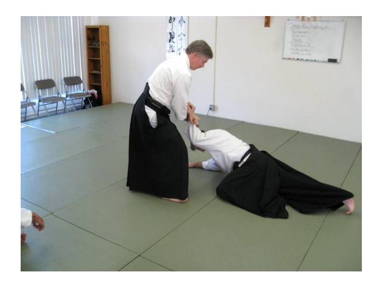
The author teaching Saigo Ryu martial arts

and various healing arts as well. That wasn't luck either.