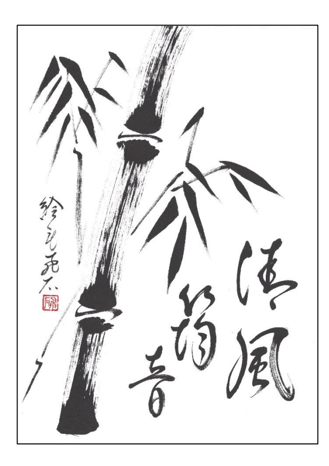
The sound of a pure breeze in the bamboo

For instance, I studied Western art—particularly water color painting and drawing—in high school