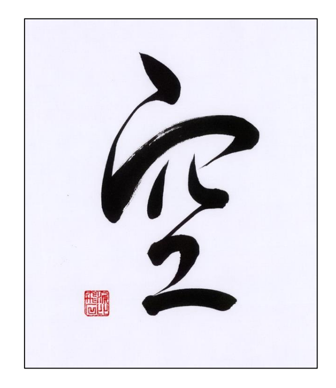
Ku, or empty space, brushed in gyosho script by the author

And we can get it back, but we have to make up our minds to do so, rather than hoping that "maybe someday I'll have some space in my schedule." It's something I hear as a teacher regularly, but I don't recall anyone that said this eventually finding time to seriously practice with me. Even if such individuals discover time to join a dojo at best they just dabble.