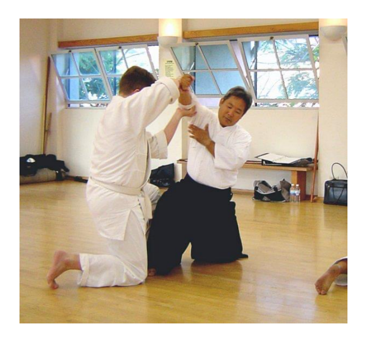
The author (right) practicing Takeuchi Ryu kumi-uchi kata

But beyond that, within each koryu ryuha, there are classifications of kata based on your ability to