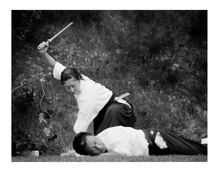
Bitchuden Takeuchi Ryu in Kyoto

The danger I see, however, is mixing the two systems of teaching up. Trying to introduce the shoden/chuden/okuden into modern budo doesn't make sense. The ship already left the harbor. You can't change the teaching methodology without messing up the entire integrity of the system. So, a koryu wannabe karate studio really shouldn't just