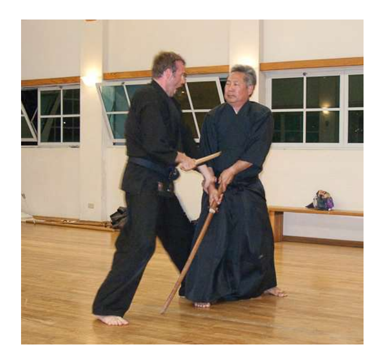
The author (right) demonstrating Takeuchi Ryu

There are a number of things to consider concerning ai-uchi. In a sportive contest of point-taking, like kendo or karate, it's a lot of fun to just go at it and strike the opponent without fear of much bodily injury, thanks to rules and protective gear. But the samurai were a conservative lot. Their philosophy of fighting and combat—which may surprise modern day martial arts people who strut and preen about