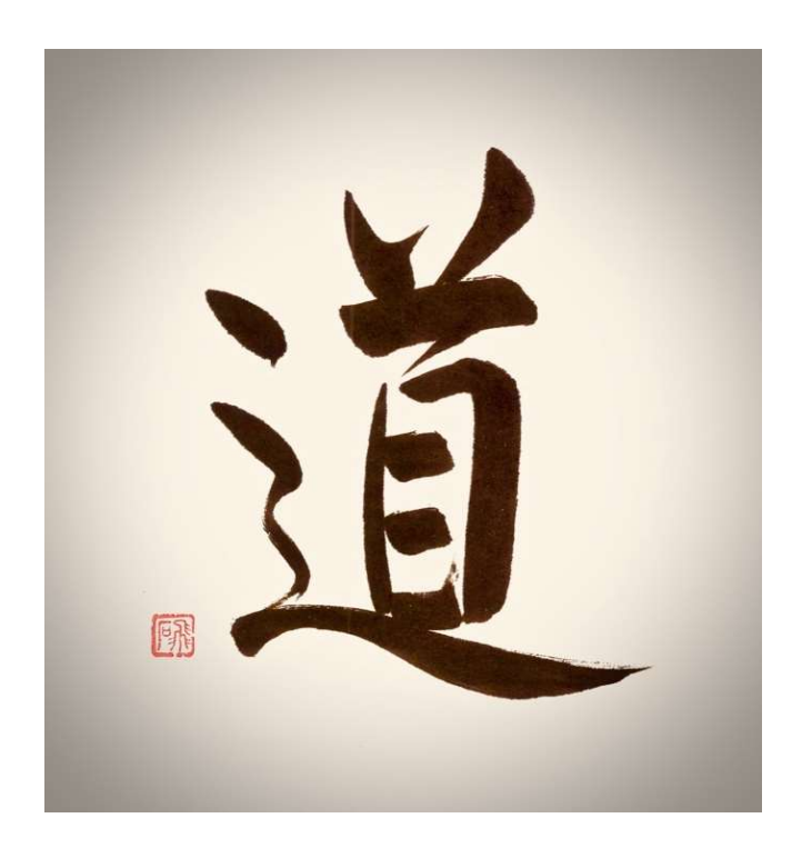
Do, the "Way," in Japanese culture refers to more than a method of doing something like budo. It suggests a Way of living and even the Way of the universe.