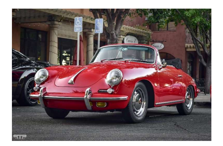
The author's antique Porsche

In addition to his swords, my dad also left me his car, a1964 Porsche cabriolet. I could appreciate its beauty