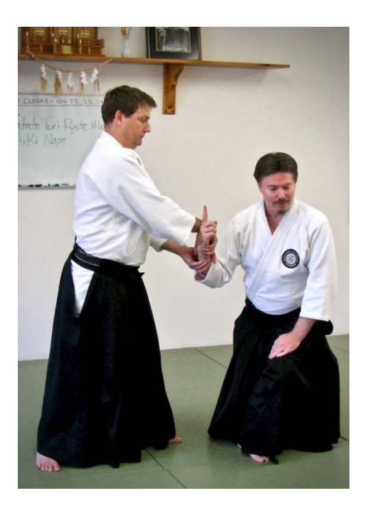
The author (right) teaching classic Japanese jujutsu in his dojo

gone within a generation if we fail to fully absorb its teachings and if we fail to spread this Way through our own teaching. Each of us is a guardian of budo. And this isn't just the case for senior students and sensei.