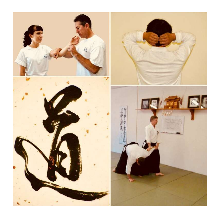
The Sennin Foundation Center teaches Japanese yoga, healing, fine arts, and martial arts.

Separate classes in Japanese yoga and meditation, healing arts, fine arts, and traditional martial arts are offered to children and adults. You can learn more about this nonprofit dojo at www.senninfoundation.com.