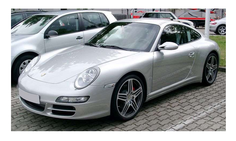
2011 Porsche 911

modified what they taught. This isn't too different from what happens to Asian food in the West.