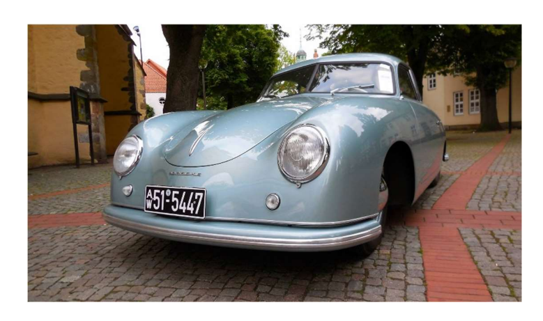
1952 Porsche 356

Early 356 and 911 cars are quite valuable, and Porsches have their own car shows that are well-attended. However, putting a Porsche engine into a Corvette body and chassis, then mating it with a Ford transmission, is tough to pull off. It doesn't always run well, and even if it works great, you won't