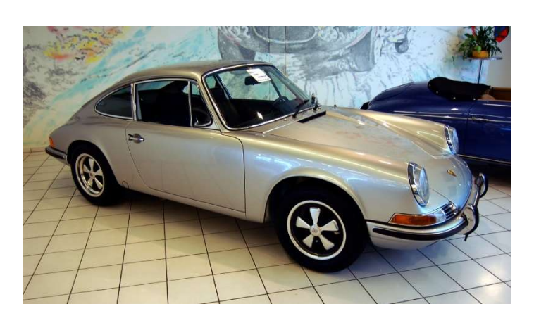
1969 Porsche 911

And this is even the case for some dojo founded in Europe or the USA by Japanese, who are using the name of an ancient form of jujutsu. Especially around the turn of the century, some Japanese took up residence in the West, and some of them really did have training in Nihon jujutsu. The problem, with a few exceptions, is that most of them heavily