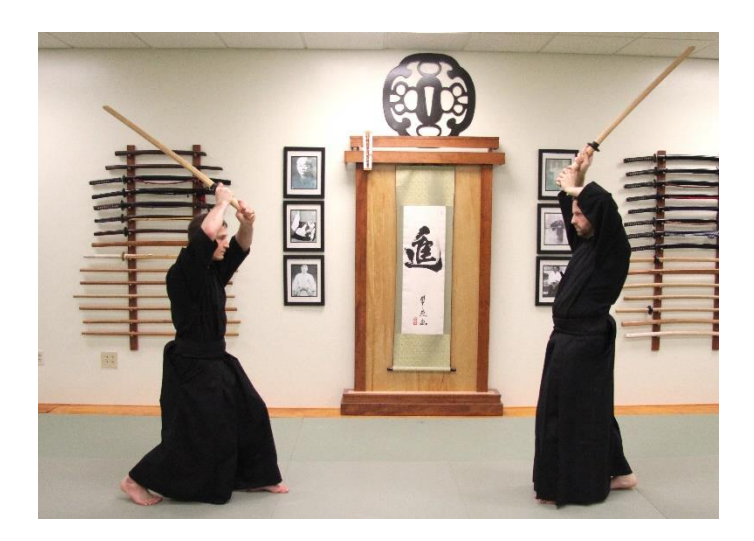
Figure 6: Uchidachi (left) and shidachi (right) in Jodan no Kamae

In the sixth waza, Ukenagashi, Uchidachi advances to cut at shidachi. Shidachi parries the cuts and returns with a strike of his own in one motion. In