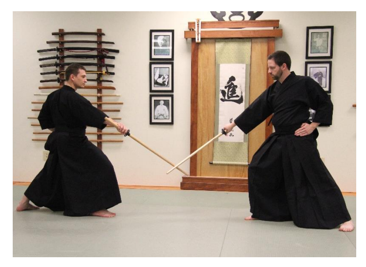
Figure 1: Uchidachi (left) and shidachi (right) matching swords in a low posture) cut

(Deai 出合: "Meeting," Kobushitori 拳取: "Taking the Fist," Zetsumyoken 絶妙剣: "The Exquisite Sword," Dokumyoken 独妙剣: "The Solitary Wondrous Sword," Tsubadome 鍔留: "Sword Guard Stopping," Ukenagashi 請流: "Flowing Parry," and Mappo 真方: "True Method/True Direction"—Editor)