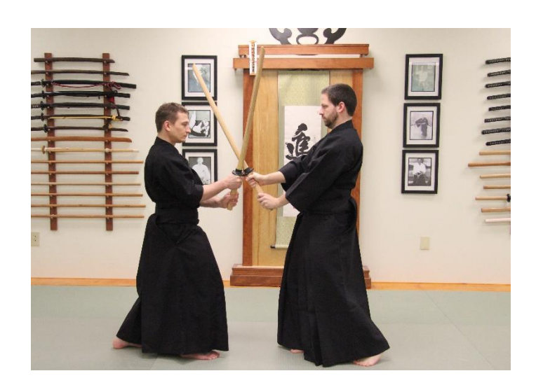
Figure 5: Uchidachi (left) and shidachi (right) crossing swords during Tsubadome

is caught by the second. This is another example of the Initiative of Attack. In the previous waza, the attack was singular, or nearly so. In this waza, however, the initiative and attack is continued. Shidachi overwhelms uchidachi, who is unable to keep up. In practice this is best expressed if shidachi's attacks have an accelerating quality to them, and uchidachi feels himself falling behind.