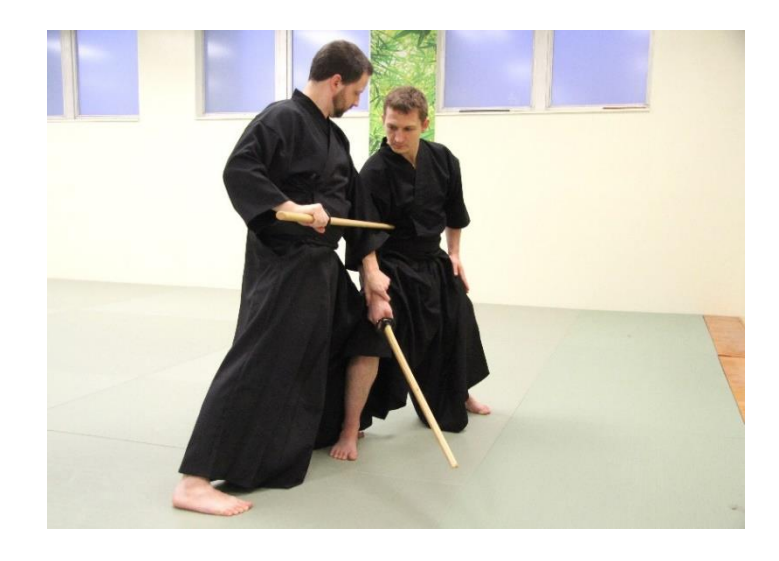
Figure 3: Shidachi (left) grasping uchidachi's (right) sword hand at the conclusion of Kobushitori

uchidachi's sword hand while positioning his own sword to thrust into uchidachi's abdomen. This waza can appear artificial to some because uchidachi makes no movement as shidachi attacks. However, shidachi's attack is intended to prevent just this from happening, hence the grab. That there is no overt struggle against shidachi's grab is simply to make the waza clean in demonstration. To express the waza in the most honest and meaningful way, shidachi's should think of the matching of swords as the preface to his attack. It is the bridge, or the exploratory reaching out, and his mind should