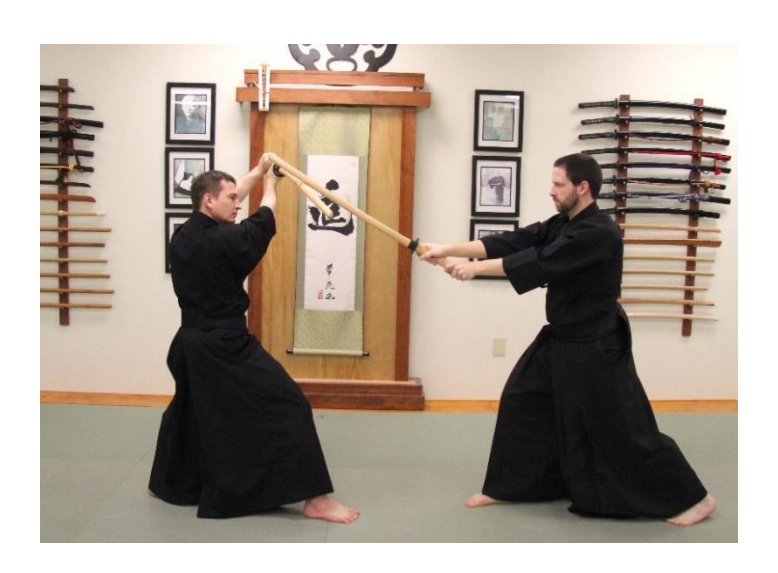
Figure 2: Uchidachi (left) blocking shidachi's (right) cut during Deai

The second waza, Kobushitori, begins like Deai. (Figure 3) However, after the matching of swords, shidachi takes the Initiative of Attack and grasps