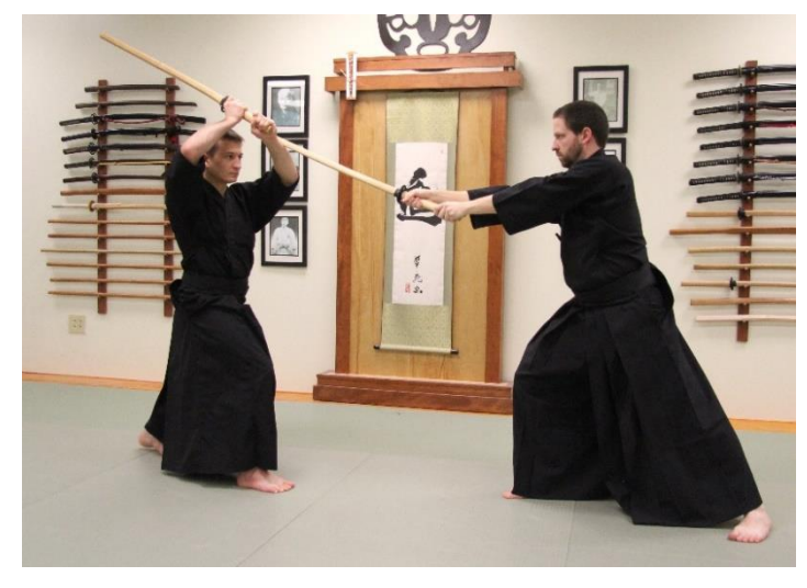
Figure 4: Shidachi (right) cutting uchidachi (left) at the conclusion of Zetsumyoken

The third waza, Zetsumyoken, begins with a high matching of swords after which shidachi cuts at uchidachi twice more while advancing. (Figure 4) Uchidachi falls back while blocking the first cut but