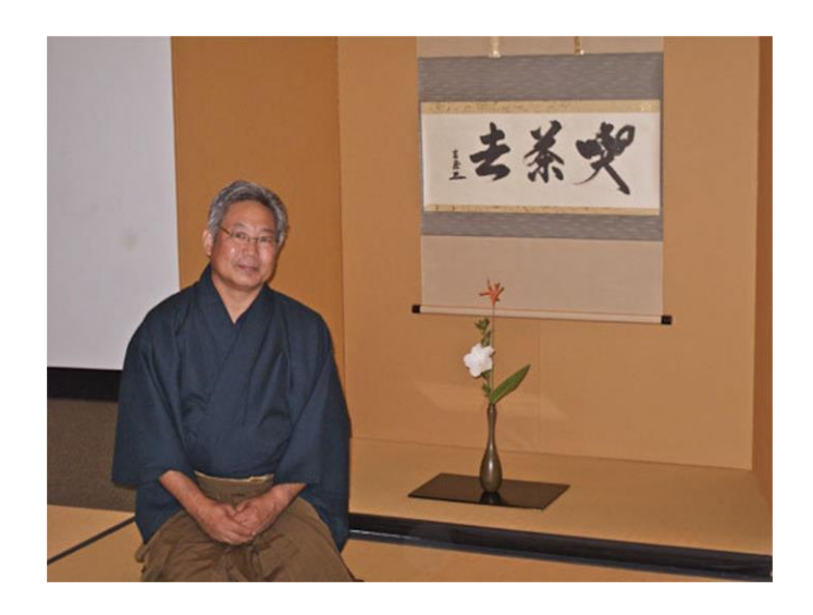
Aside from his lifelong fascination with classic Japanese martial arts, the author is an experienced practitioner of Urasenke tea ceremony

Classical koryu systems will, in contrast, often (but not always) look and sound quite different from Kodokan judo. Some, meant for foot soldiers, may have very effective but crude-looking methods. Others, developed for upper class samurai, may appear refined and subtle. Some koryu jujutsu may include only fighting methods for military purposes. Others may include kata for self-defense or early