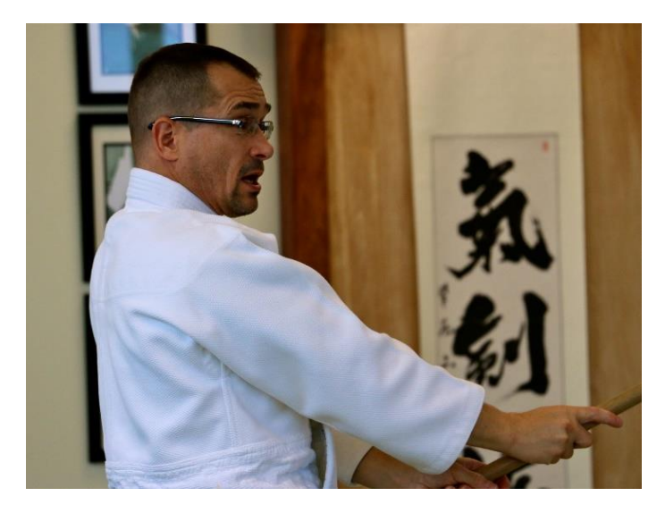
The author teaching budo

Check with the sensei to find out what the proper checkpoints are, make sure you understand them, and try to execute them. Once you get close to the example set by the sensei, practice that aspect over and over until you perform it reflexively. Next time you come to the dojo, run through it a few times to make sure you are still doing it right, and come back to it now and then in the future to see if you can make it better.