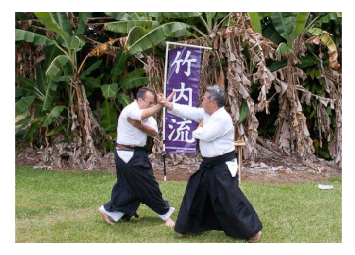
The author (right) performing Takeuchi Ryu jujutsu

necessarily mean we should leave our judgment at the door. We should assess each and every martial art we encounter and quickly size up the technical worth of that particular ryu ("school, system"). Modern jujutsu, or "jujitsu" schools, as they label themselves, tend to be somewhat simplified, and sports and/or self-defense oriented. On the other hand, some classical koryu jujutsu schools may have become little more than shells of their original form due to the low level of their subsequent teachers.