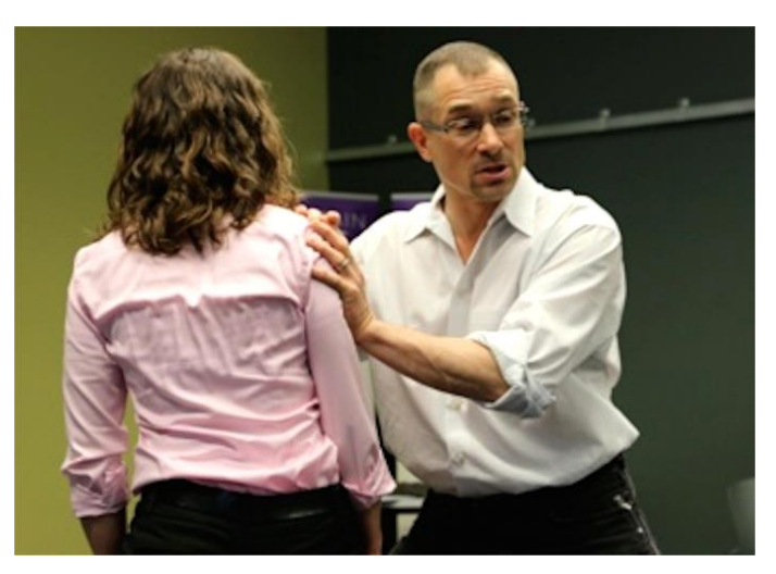
From Chaos to Kata

Suino Sensei has also launched an interesting new project called From Chaos to Kata, which you can read more about here: <u>http://chaos2kata.com/</u> Leadership_Training.html. The website offers this explanation: